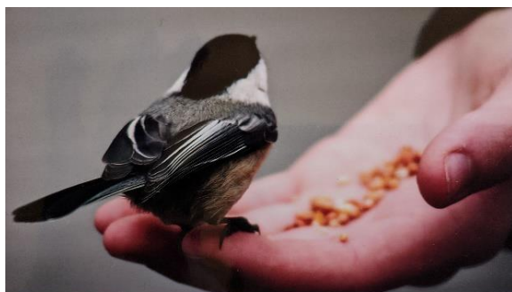
TO THE WORLD YOU MIGHT BE JUST ONE PERSON, BUT TO ONE PERSON YOU JUST MIGHT BE THE WORLD CHICKADEE • FAITH

I’m reminded of the quote, “To the world you might be one just one person, but to one person you just might be the world.” Our sacrifice doesn’t have to be of the WWII type to be